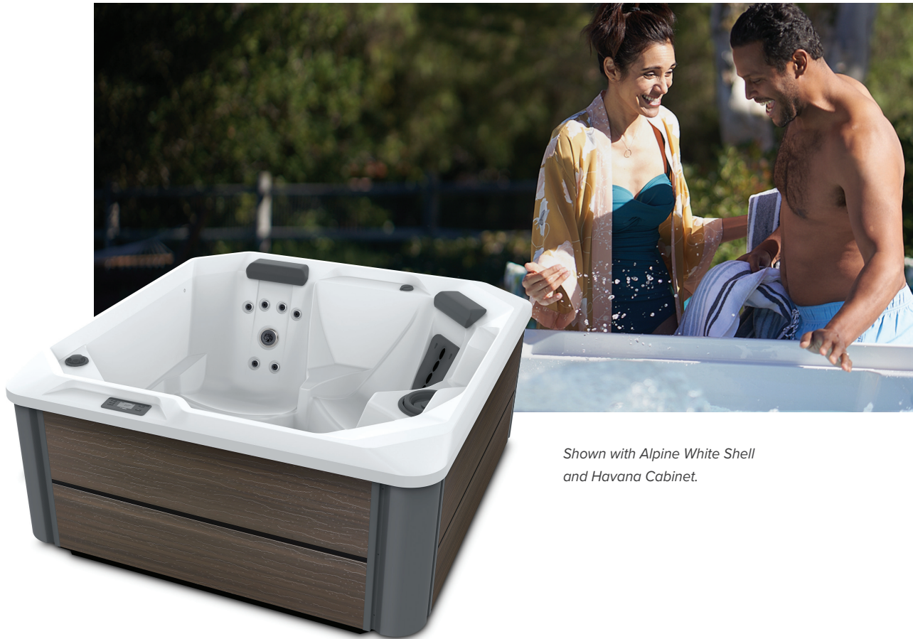
Shown with Alpine White Shell and Havana Cabinet.

People Seating Jets Voltage 3 Seats Open 18 Jets 115 V or 230 V