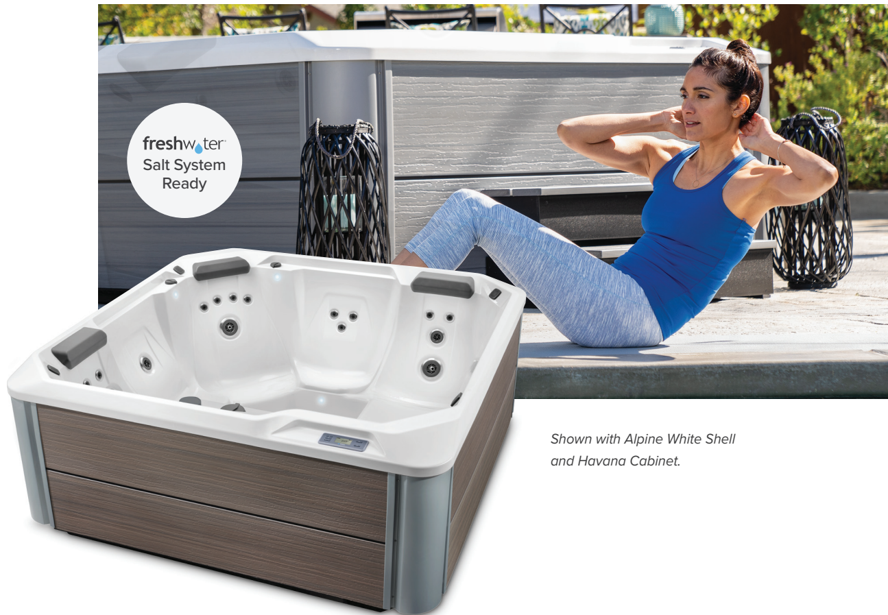
Shown with Alpine White Shell and Havana Cabinet.