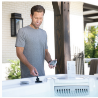
FreshWater® Salt System Ready